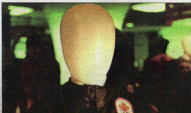
Macfarlane's interpretation of "Blank" had the Olympic spirit.